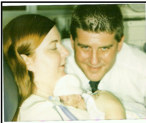
First cuddles with mum.